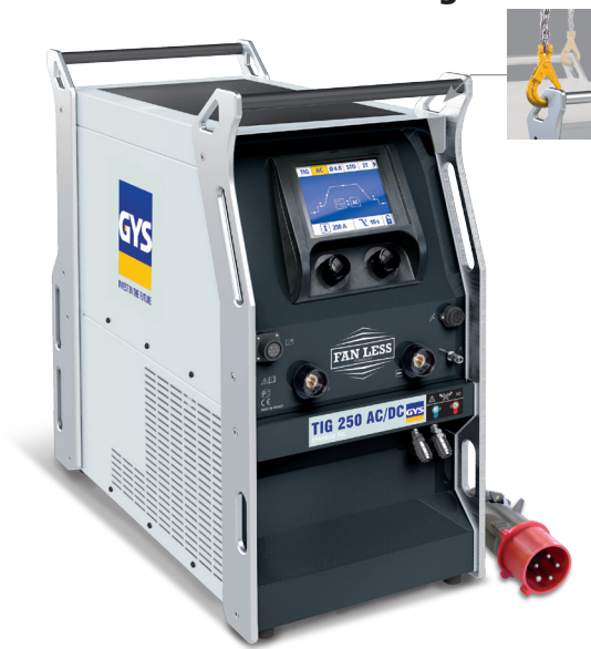
Supplied without accessory