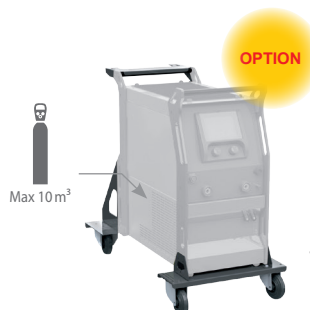
Trolley ref. 040960

Easy mode or PRO mode with access to every parameter.